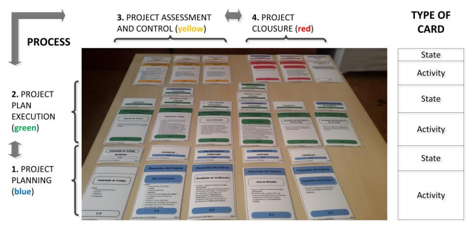
Fig. 2. An example of Virtual Board

In order to facilitate comprehension, learning, memory, communication and inference of the PM process, authors define a virtual board and color code based on the four activities in the PM process. Figure 2 shows as each activity is a suit: Project Planning (blue), Project Plan Execution (green), Project Assessment and Control (yellow), and Project Closure (red). The white color represents the input and the output of the PM process – «Statement of Work» and «Software Configuration» . Each suit has two types of cards: an activity card and a state card. The first one depicts the work products and has a list of tasks related. The second one depicts the possible states of each work products.