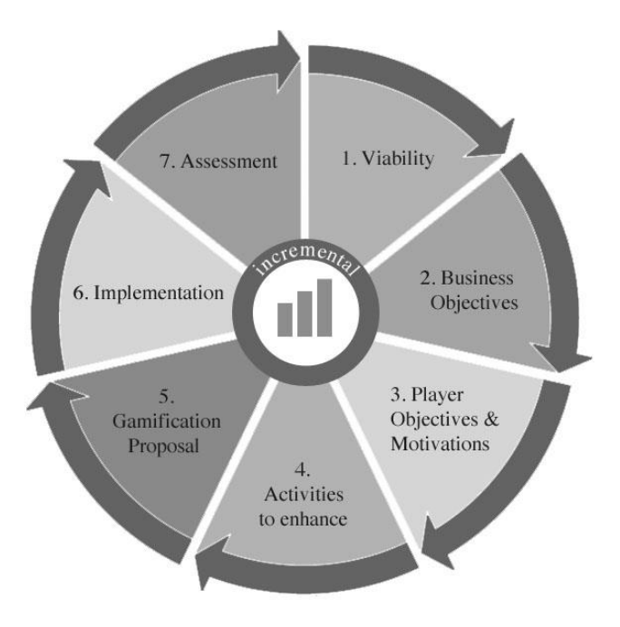
Figure 1: Phases of the gamification framework